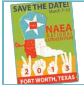
National Convention discounts!