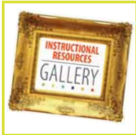
Access exclusive lesson plans!