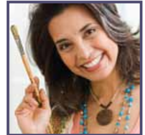
Connect with AEI art educators!