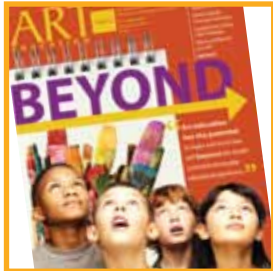
Receive $50+ in subscriptions!

Connect with art educators in your state and across the country as an NAEA /AEI member and receive exclusive benefits that can stimulate your career, your classroom, and your creativity.